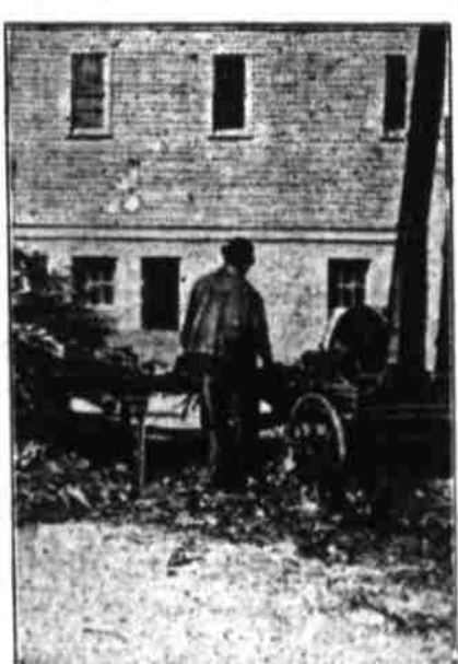
Filling the Silo With Corn—More Corn Roughage is Needed, Especially in Regions Where Legumes Do Not Thrive.

silo and the feed, as ordinarily silage juices collect there unless proper facilities for drainage are provided and the straw acts as a valuable absorbent for this excess of moisture which otherwise might damage the bottom silage.