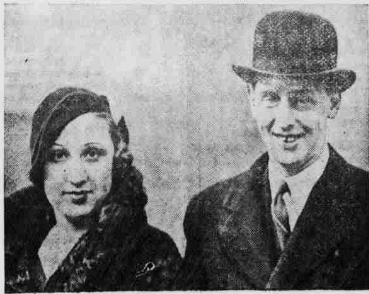
Prince Nicholas of Rumania who is reported to have renounced all his royal rights in order to stay with his wife and their four-year-old son. They will move into French exile. Photograph shows Nicholas and his wife soon after their marriage. The case bears some similarity to that of ex-King Edward of England, now the duke of Windsor.

things, Serval, Inc., makers of the Electrolux kerosene refrigerator, offer $900 in cash scholarships and eight refrigerators to national and sectional winners, trips to the 16th National 4-H Club Congress in Chicago for state winning members, and gold medals to county champions. Many local girls are expected to participate.