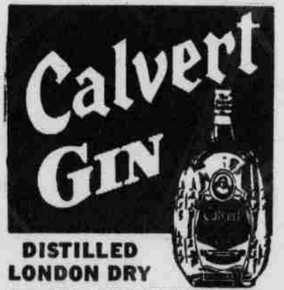
Distilled London Dry. Corp. 1937 CALVERT DISTILLERS CORP., RELAY, MD., AND LOUISVILLE, KY. EXECUTIVE OFFICES: CHRYSLER BLDG., N. Y. C. CALVERT LONDON DRY GIN—50 PROOF—distilled from 100% American grain neutral spirits.

UN-HEAT YOURSELF... with a Calvert Gin Rickey! Lime Juice is alkaline, you know—and Calvert Gin gives it a smooth, refreshing taste... neither too sweet nor too tart. Plenty of ice and fizz-water, of course. But call for Calvert Gin. You know what to expect from Calvert.