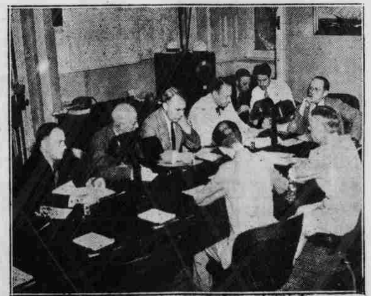
Senate Sub-Committee Hears Retirement Bill

If the Congressional Bill known as H.R. 5233 is passed and adopted the enlisted men of the U. S. Coast Guard shall be entitled to be transferred to the Fleet Naval Reserve upon the completion of 20 years service, and when transferred shall, except when on active duty, receive pay at the rate of one half the base pay they were receiving and in some cases more.