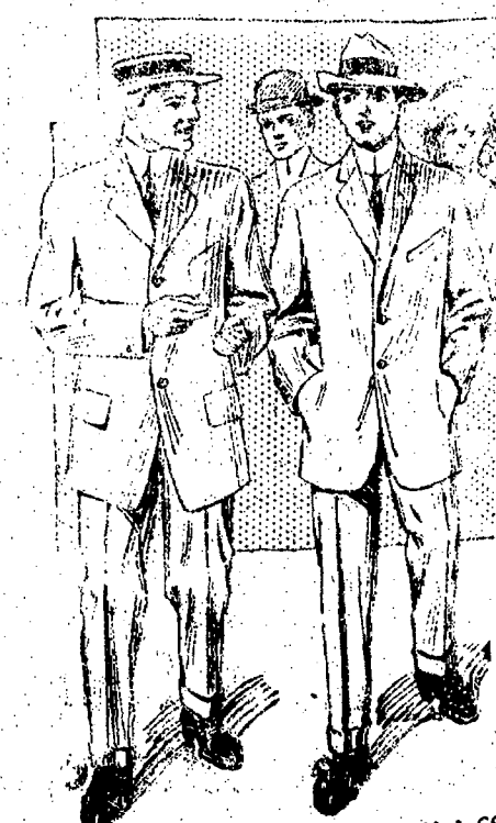
GOLDMAN BECKMAN & CO Good Clothes

From 8 to 18 size, $1.75 to $7.50. These are Norfolk and double-breasted.