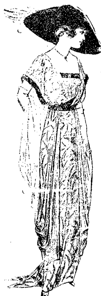
McCall Patterns 5047, Waist 5046, Skirt Price, 15 cents each LADIES' DRESS

Long coats and jackets at unmatchable prices. $8.00 and $10.00 ladies coat suits special at $6.95. $12.50 and $15.00 ladies coat suits $9.95. $20.00, $22.50 and $25.00 ladies coat suits at $14.95. Ladies long coats $3.00 to $15.00. Have you seen those long Zibilene coats $10.00 value $6.95. They are the talk of the town to all those who have seen them. What values they represent. Johnnie coats $10.00 values at $7.95. $12.50 values at $8.95. Umbrellas for gifts. See our offerings at 50 cents, 85 cents, $1.45, $3.50. Holiday handkerchiefs. 2 for 15 cents, 3 for 25 cents, 6 for 59 cents. Men and Ladies linen handkerchiefs 10 cents, 15 cents, 25 cents. Special offerings in jewelry. Some great savings in this department. 25 cents bar pins special 15 cents. 50 cents bar pins special 35 cents. $1.00 bar pins special 75 cents. 25 cents cuff pins three to the set 15 cents. 50 cents cuff Pins 35 cents. 50 cents coin purses special at 25 cents. $1.00 mesh bags at 75 cents. $5.00 german silver mesh bags special at $3.75, and $4.00. Hand bags 75 cents to $2.00. 75 cents ladies neck wear 50 cents. Beautiful line of ladies neck wear at 25 cents. Blazer coats. Large lot of blazers and coats values from $2.50 to $4.00 special now at $1.99. Ladies waists, new things just arrived