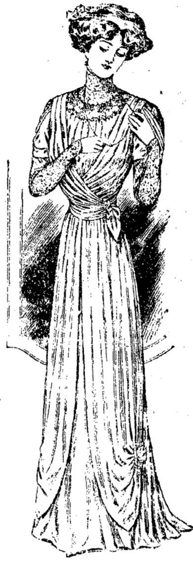
McCall Pattern No. 3183 ELEGANT DRESS OR EVENING GOWN

27x54 Jap Rugs, special for this sale 19c. $5 Jap Rugs 9x12 ft., special for $2.59. $1 Brussels rugs 27x54, special 75c. $1.50 velvet rugs, special 99c. $1 velet rugs, special $2.99. $15 to $20 brussels seamless art squares, 9x12, $11.95. 500 yds sheeting, 1 yd wide, suitable for wall papering, 4c per yd. 3000 yds. 1 yd. wide sheeting, nice smooth goods value 6 and 7c, at 5c. 2500 yds Sea Island sheeting, heavy, worth 8c, special 6c. 4000 yds. 3/8 inch dimity, pajama checks, fancy white goods worth 12 1-2, 10c. 4000 yds bleaching, 1 yd wide, regular 10c quality, special for this sale 8c. 2000 chambray regular 10c quality, 6c.