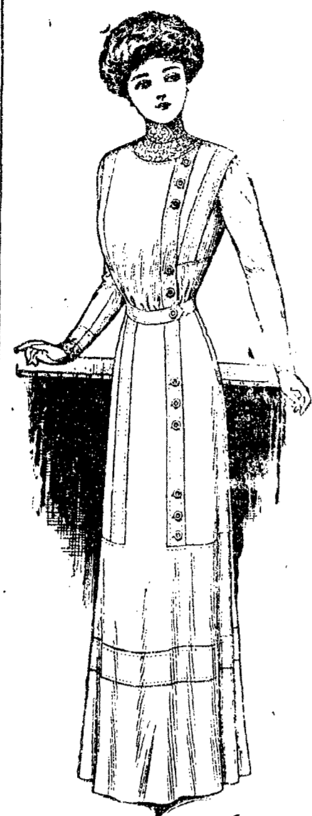
McCall Pattern No. 3611 CHIC AFTERNOON COSTUME

15000 yds Plant bed muslin, Special 2 1-2c.