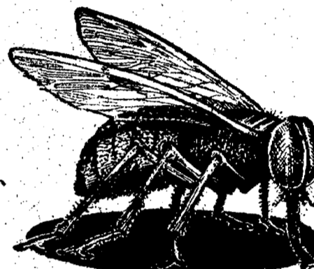
The Common House Fly (magnified) The most dangerous Insect known to Man

Save your baby's life—Read the May N. C. Health Bulletin. We have the remedy, Bradley's Drug Store.