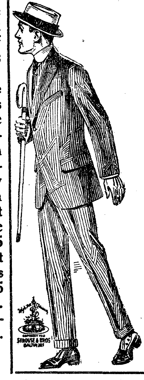
They Look the Part

Battalion of the Downie & Wheeler Show Decorate Town With Picturesque Posters.