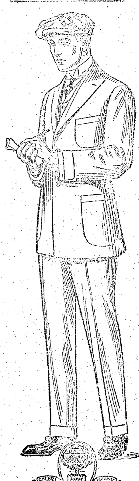
Copyrighted, 1913, A. B. Kirschenbaum Co.