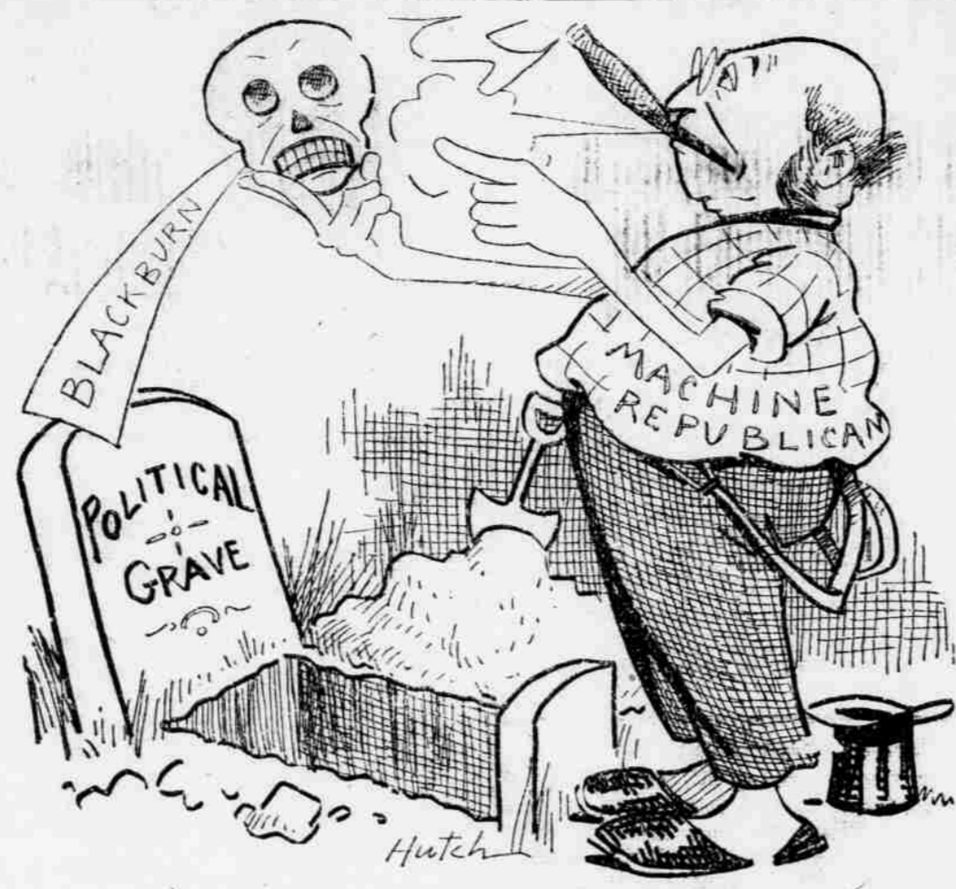
Alas, Poor Yorick, I knew him well!—Shakespeare.

The letter which is dated Dublin, June 10th is in part as follows: "Your letter received and also the newspaper clippings. You have my sentiments regarding Bryan, as I look upon him as one of the most able men in our country. I have no doubt but he was robbed of both elections, by the trusts and also misjudged. I hope I may live to see him President of the United States."