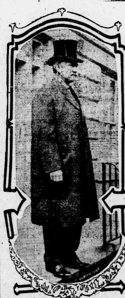
RICHARD A. BALLINGER

The correspondence between the president and the secretary is not voluminous but displays beyond question the confidence which Mr. Taft has reposed in Mr. Ballinger throughout the long siege and the indignation with which he has viewed the attacks upon the secretary's personal and official integrity. "I had the fullest opportunity," the president says, in his letter accepting the resignation, "to know you, to know your standards of service to the government and the public, to know your motives, to know how to have administered your office and to know the motives of those who have assailed you. I do not hesitate to say that you have been the object of one of the most unscrupulous conspiracies for defamation of character that history can show." And in the conclusion of his letter the president declares that "every fibre of my nature rebels against such methods to the bitter end, and I do not hesitate to say that I have been the object of one of the most unscrupulous conspiracies for defamation of character that history can show." The president goes on to declare that he himself has been the ultimate object of the attack and says that he insists upon Mr. Ballinger's remaining in office "with the prospects of a further effort against