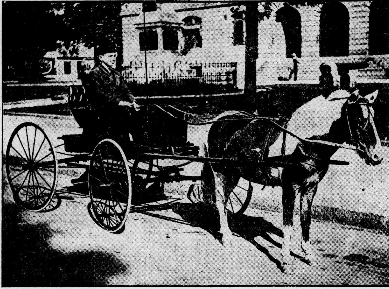
A Photograph of the Beautiful Shetland Pony, Fine Rubber Tired Buggy and Set of Harness that will be Given to the Contestant Having Largest Vote at Close of the Contest.