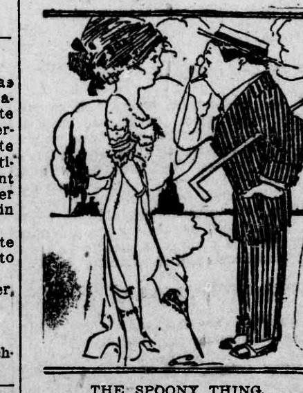
THE SPOONY THING. Jack—"I expect to die hard." Maud—"Then you won't die as you have lived." Jack—"What do you mean?" Maud—"You have the reputation of being pretty soft."

"Where ignorance is bliss 'tis folly to be wise," quoted the Wise Guy. "Yes, especially in the case of the fellow who has more money than he knows what to do with," added the Simple Mug.