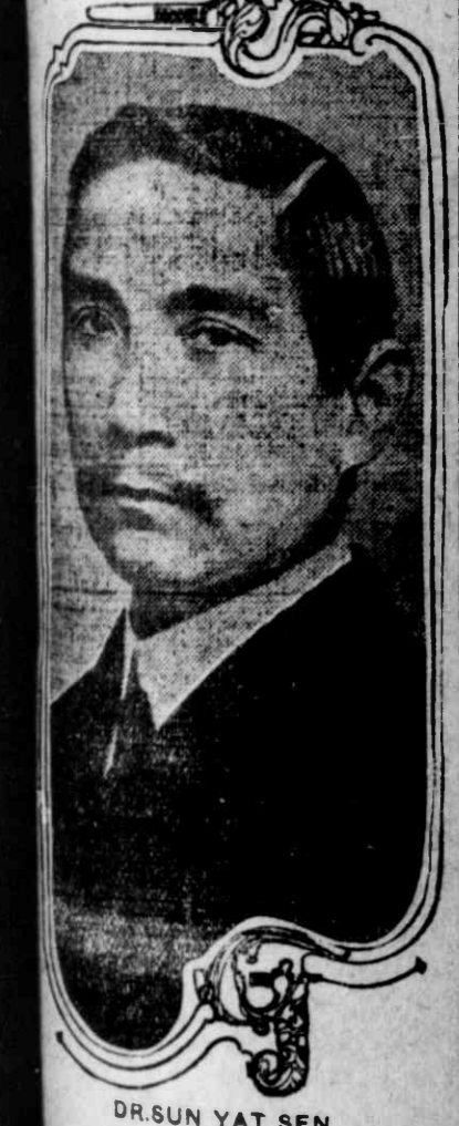
DR. SUN YAT SEN