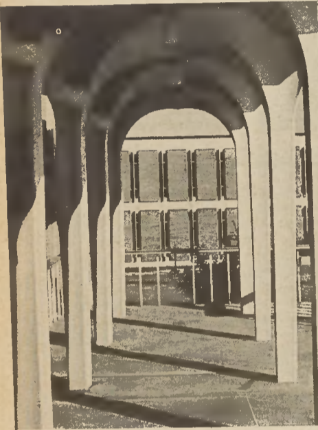
Part of the Liberal Arts building is framed by arches of the tulips on the Kennedy Building.

Here are a few unusual (we hope) views of the UNC-C campus as seen by Photographer Tommy Estridge.