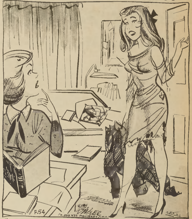
"— AND HE WAS CAPTAIN OF THE DEBATE TEAM."