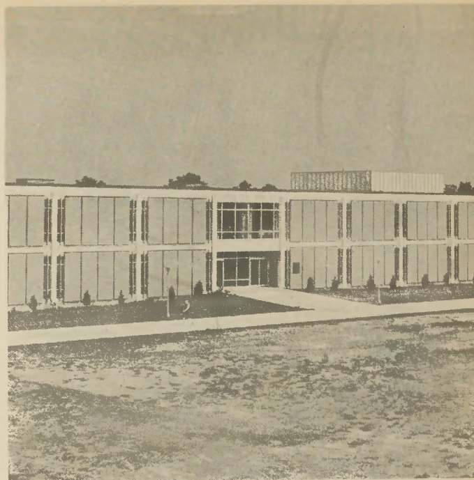
An addition to the Atkins Library, pictured here, was included in the pre-planning.

Other random recommendations made by the self study were that majors in German, Philosophy, and Physics be begun, that the English department begin an "English Clinic" for remedial work by advanced students who are still deficient in reading and writing, that a junior-senior year abroad be begun for foreign language students and that an honors program be created.