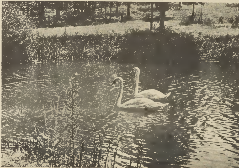
Name these swans and win two tickets to see the Bitter End Singers.