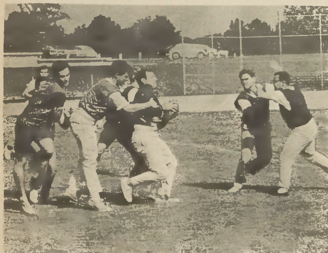
This stop action shot of the student-faculty football game