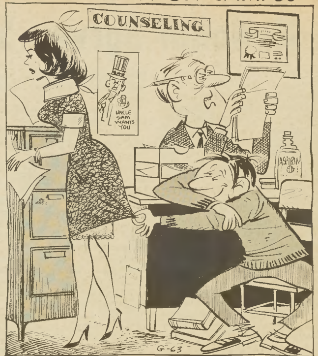
"ALTHOUGH THESE TESTS REVEAL NO SPECIAL TALENT—THERE IS EVIDENCE YOU HAVE A RESTLESS, PROBING MIND."