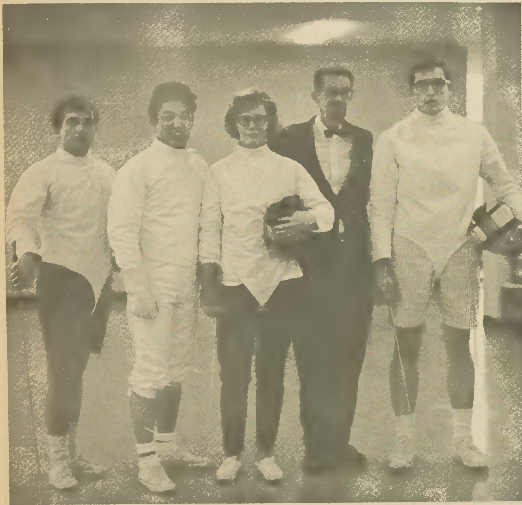
Members of the fencing team take time out from their demonstration last Wednesday, for a team snapshot.