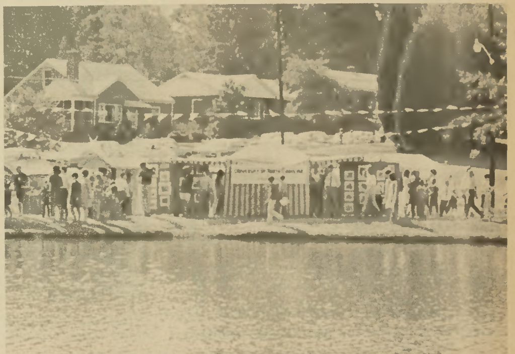
The booth where so many worked so hard