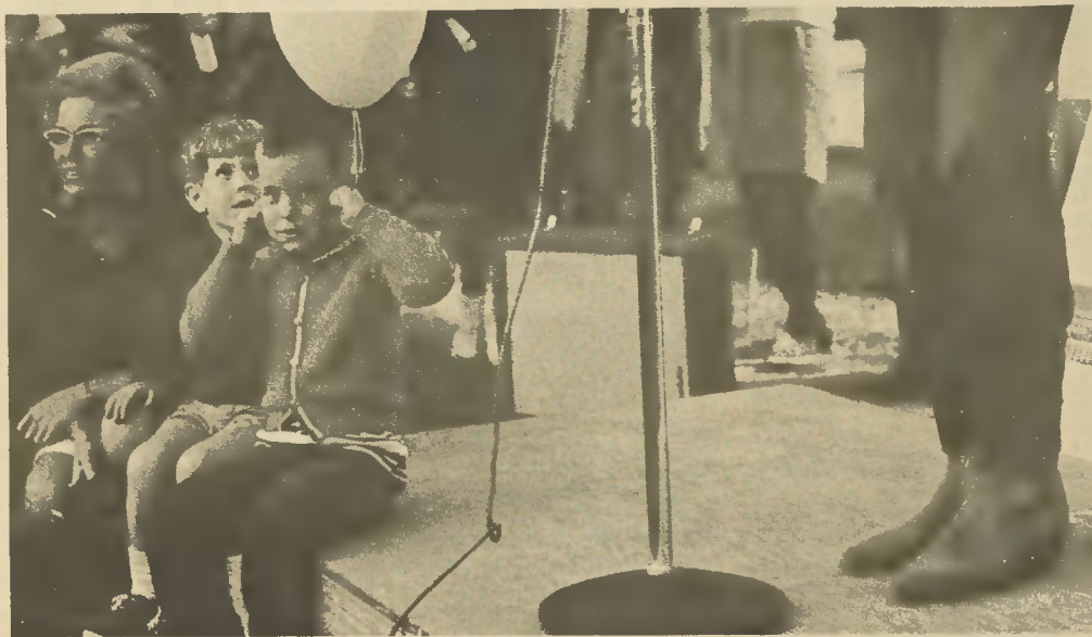
A music critic at Jerry's feet