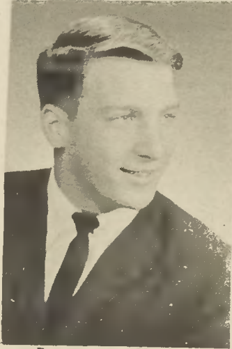
Do you know who this is?

Write your guess on a slip of paper and leave it in the Journal box at the Union desk.