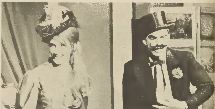
"Beauty's Only Skin Deep, But Ugly Goes All The Way Through."