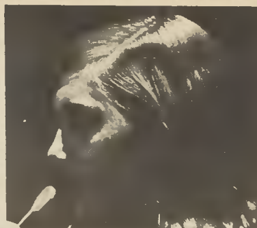
"Pickle-flavored Pregnant People Pop. . ."