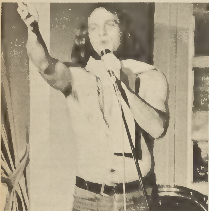
And if elected . . .