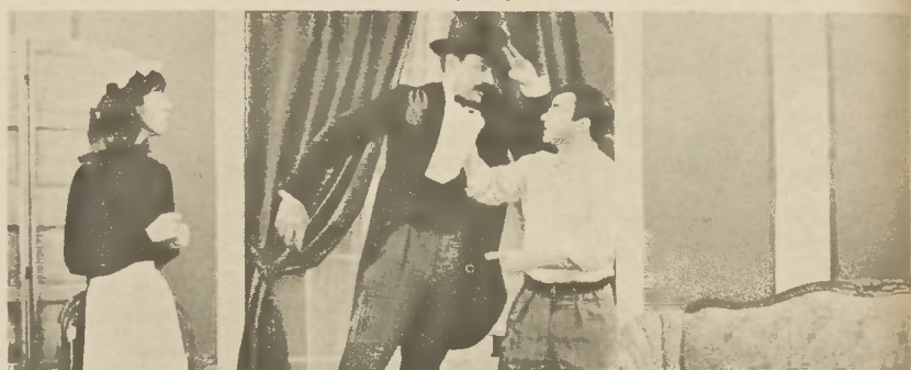
"Your fly's open."