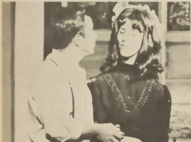
"That's nothin', compared to what I'd like to do to you."