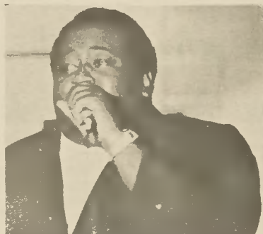
"So what's a James Brown?"