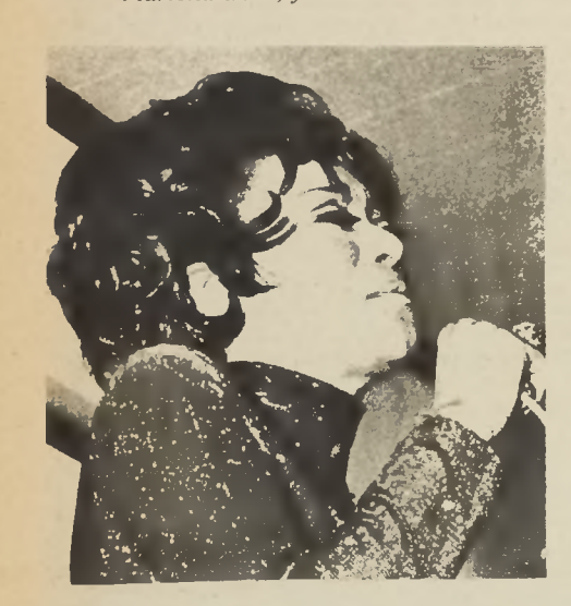
Tell it like it thinks I am.