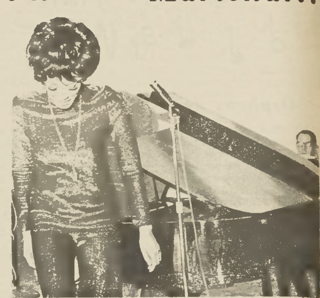
"This is a cut from my newest album, 'Marlena Shaw Out of Different Bags', which, if you run right down to your local record shops, you can get for about $3.47. If you wait a couple of weeks, you can get it at my house for 86c - the record, that is.