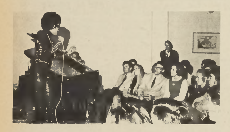
"When I say that, Do You Know What I Mean?"