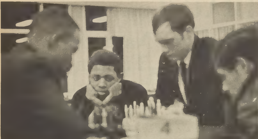
A.C.U.I. Games Tournament