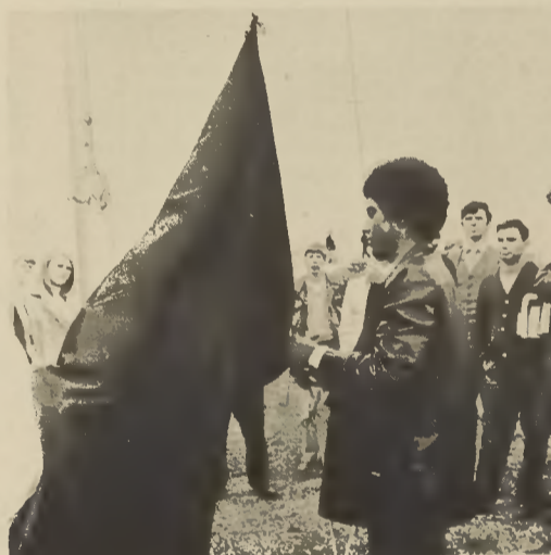
UP IT WENT