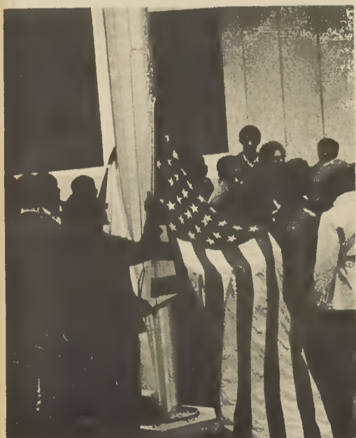
WHAT GOES UP MUST COME DOWN