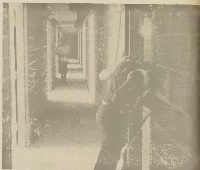
Pick a cell, any cell.