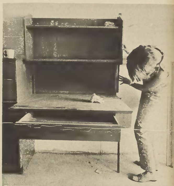
Not too big, folks!