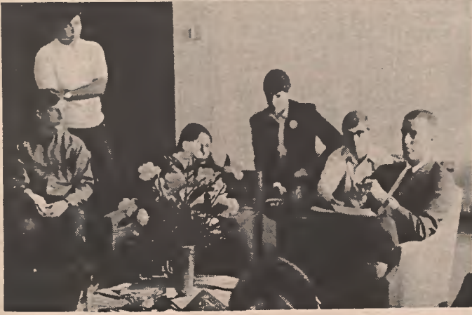
An SAC member leads a discussion group.