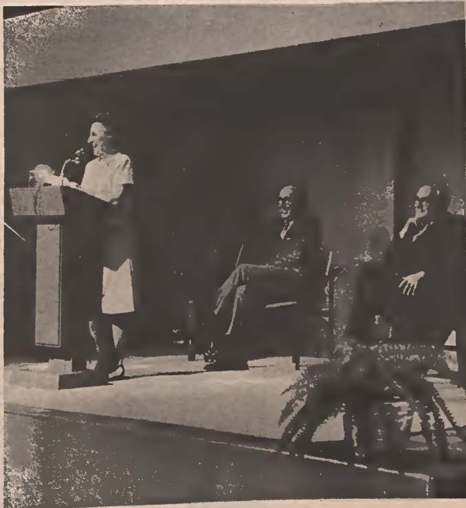
An administrative laugh.