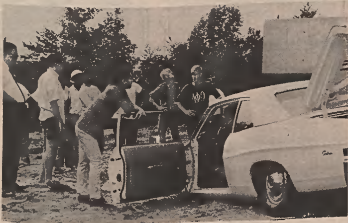
APO to the rescue.