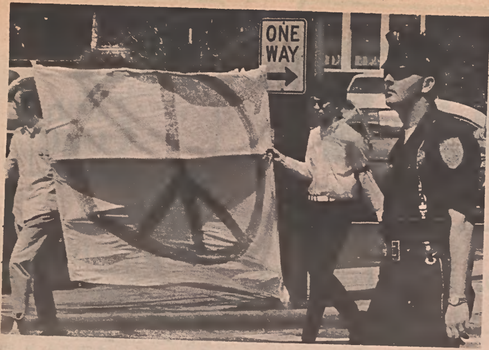
Is it the wrong way?