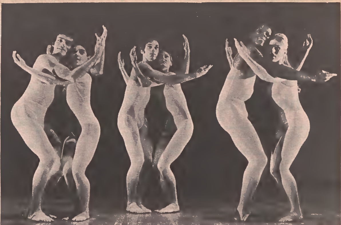
The Murray Louis Dance Company will perform at Central Piedmont Community College Friday and Saturday, Oct. 23 & 24.

(Ed. Note: Four sample "Doctor's Bag" columns have been run to evaluate your reaction to them. In general, the response has been favorable and we are purchasing syndication rights from CPS for the rest of the year. The Doctor's Bag column will resume when we complete arrangements, presumably in a few weeks.)