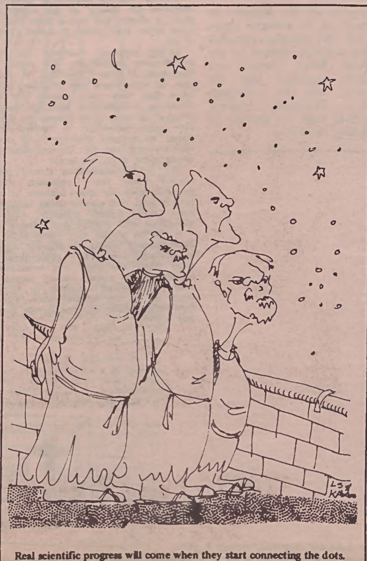
Real scientific progress will come when they start connecting the dots.

PLAY: "The Night of the Iguana" Charlotte Little Theatre, Queens Road, February 10-12, 8:00 p.m.