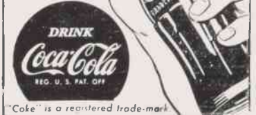
"Coke" is a registered trade-mark.