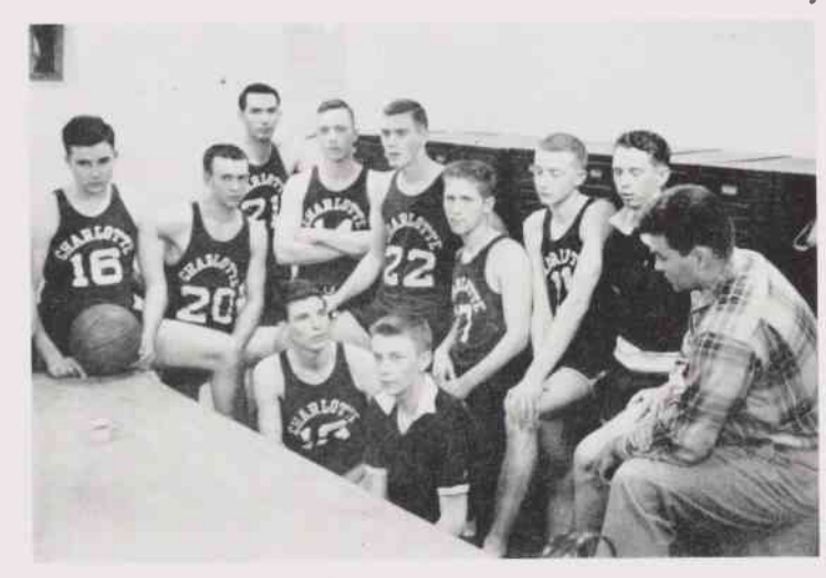
Owls After Game