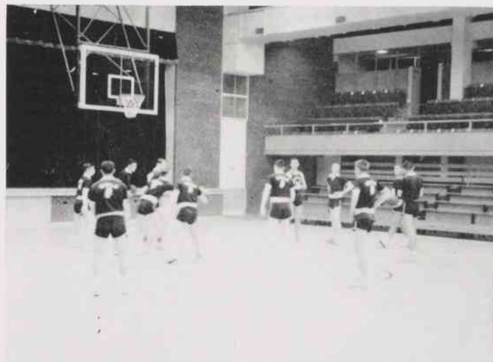
Owls Warm Up For Season's Final Game

DUKE POWER COMPANY Serving the Piedmont Carolinas