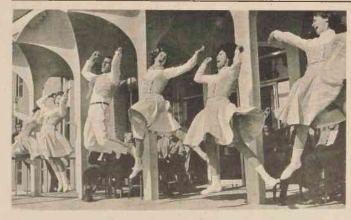
Cheerleaders lead a student rally.