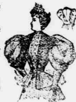
520 LADIES' BASQUE. Sizes, 32, 34, 36, 38, 40.

GOODS You buy a PATTERN of your selection.