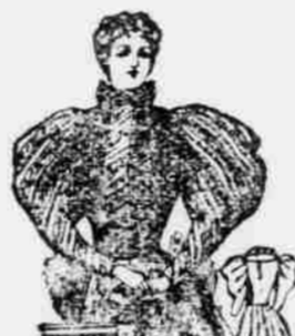
478 LADIES' WAIST. Sizes 32, 34, 36, 38, 40.

is fully guaranteed to fit as correctly as any pattern you can buy.