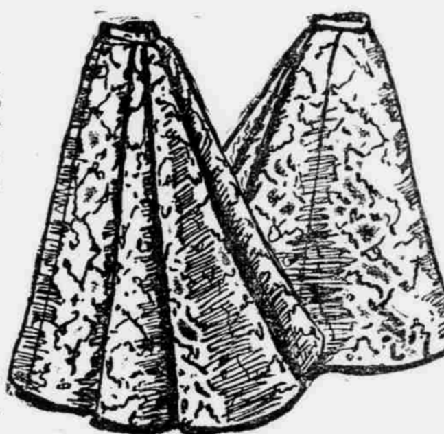
434 LADIES' ORGAN PIPE SKIRT. Sizes, 22, 24, 26, 28, 30. Quantity of material required for a medium size, 5 yards 44 inch goods.

is fully guaranteed to fit as correctly as any pattern you can buy.