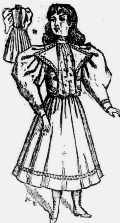
418 GIRLS' DRESS. Sizes, 6, 8, 10, 12 years.

To introduce the "New Ideo Pattern," for a short time we will give FREE with every $1.00 worth of DRY