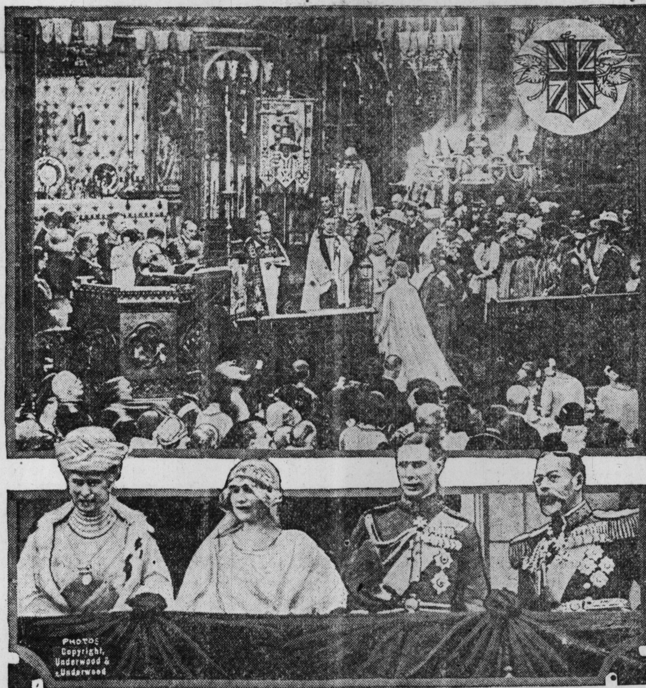
Above is the official photograph taken inside Westminster abbey, showing the actual wedding of the duke of York, second son of King George and Queen Mary, and Lady Elisabeth Bowes-Lyon, daughter of the earl of Strathmore. Below are the bride and groom, together with the king and queen, on the balcony of Buckingham palace acknowledging the cheers of the crowd.