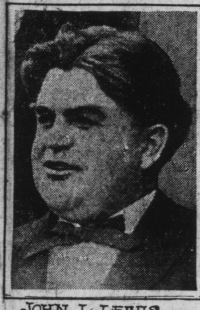
JOHN L. LEWIS

Ben B. Lindsey, noted juvenile judge, fought the decision of the Colorado-Supreme Court voiding his election as juvenile judge of Denver.