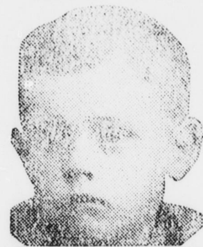
A Case of Catarrhal Deafness.