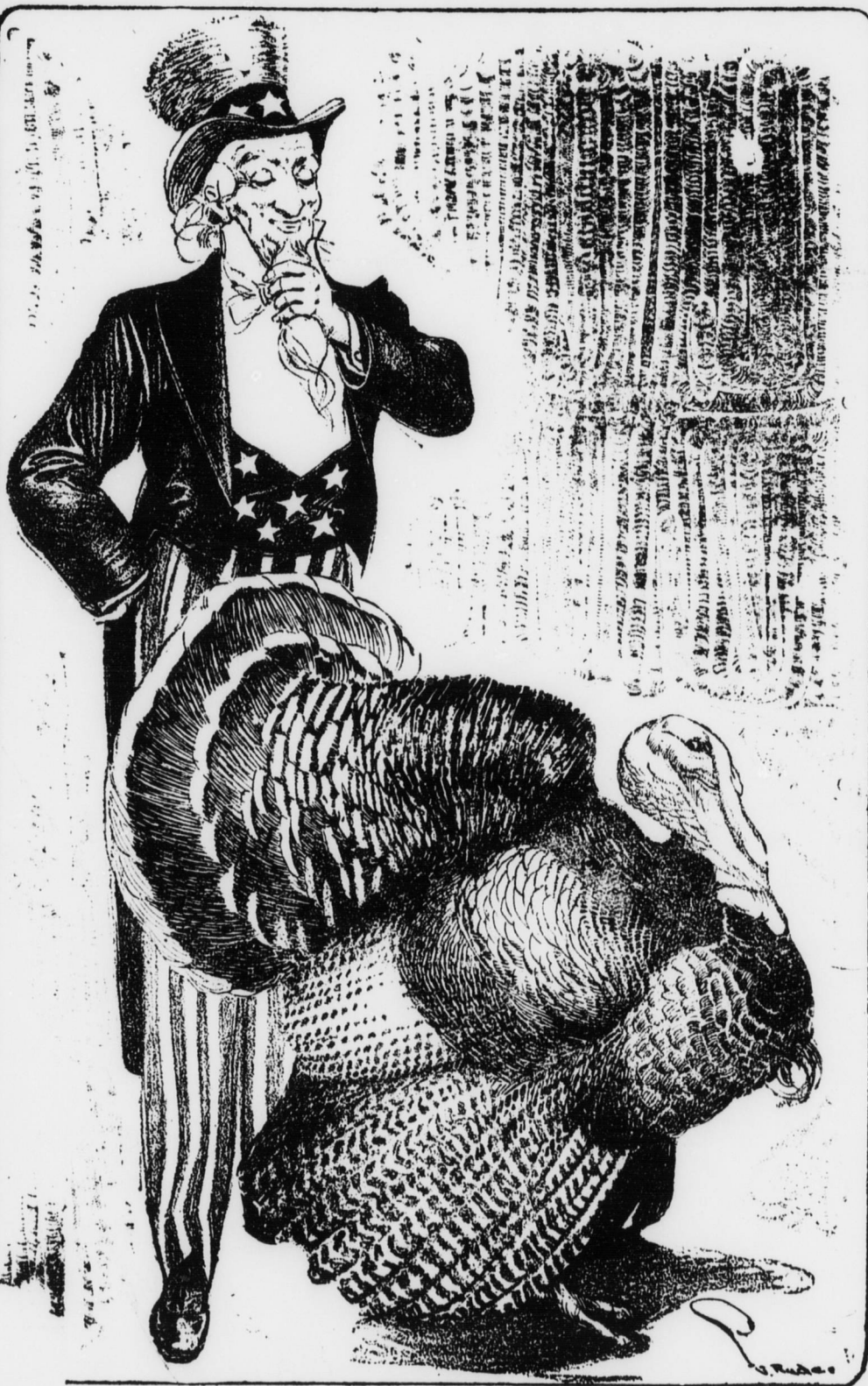
"OFF GOES HIS HEAD."

First Sale Days For November Every Tuesday, Thursday and Saturday.