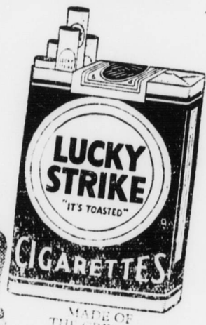
MADE OF THE CREAM OF THE TOBACCO CROP