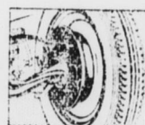
Fully Enclosed Brakes

Chevrolet valves are readily accessible and adjustable. This saves replacing valves, and also makes it possible to preserve efficiency.