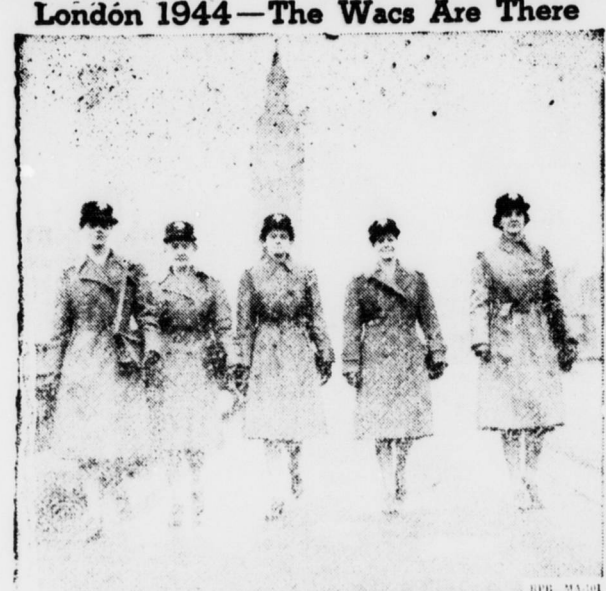
lidn't be London without a touch of fog, the chimes of Pig the uniformed soldiers or that the uniformed soldiers of that the wailing over rice's Women's Army Corps, shown here wailing over the Soldier of the London scene.