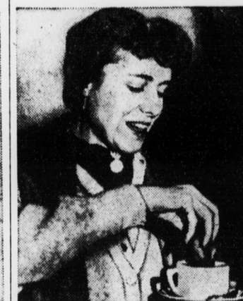
While visiting G.I.s in Europe, Rep. Clare Boothe Luce of Connecticut, showed the troops that she knew all the finer arts of doughnut dunking, learned in Washington.