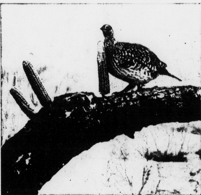
The winter feeding program of the Fish and Wildlife service calls for helping the birds and small mammals over the tough spots in cold areas. Above, a grouse is seen eating some of the corn placed on the tree. Without extra grain, after storms and blizzards, many of the birds would die. Photo was taken in sand hills of North Dakota.