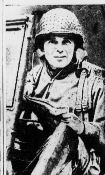
Maj. Gen. Maxwell D. Taylor, commander of the 101st Airborne division was in Washington when his division was trapped inside Bastogne. He flew the Atlantic and slipped through enemy lines in a jeep to be with his men, aiding them to win their way out.