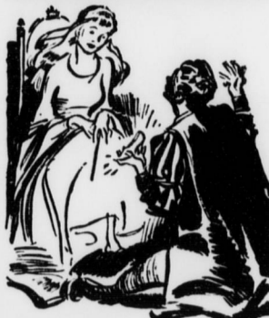
CINDERELLA WAS HUMBLER AND BEATEN AT HOME. BUT WHEN THE PRINCE SAW HER AT A BALL, HE INSTANTLY FELL IN LOVE WITH HER.

FAMOUS AS A SYMBOL OF PURITY AND SWEET, WHOLE-SOME GOODNESS, THE NU-MAID GIRL PERSONIFIES THE ONLY MARGARINE CERTIFIED BY ITS MAKER TO BE "TABLE-GRADE!"