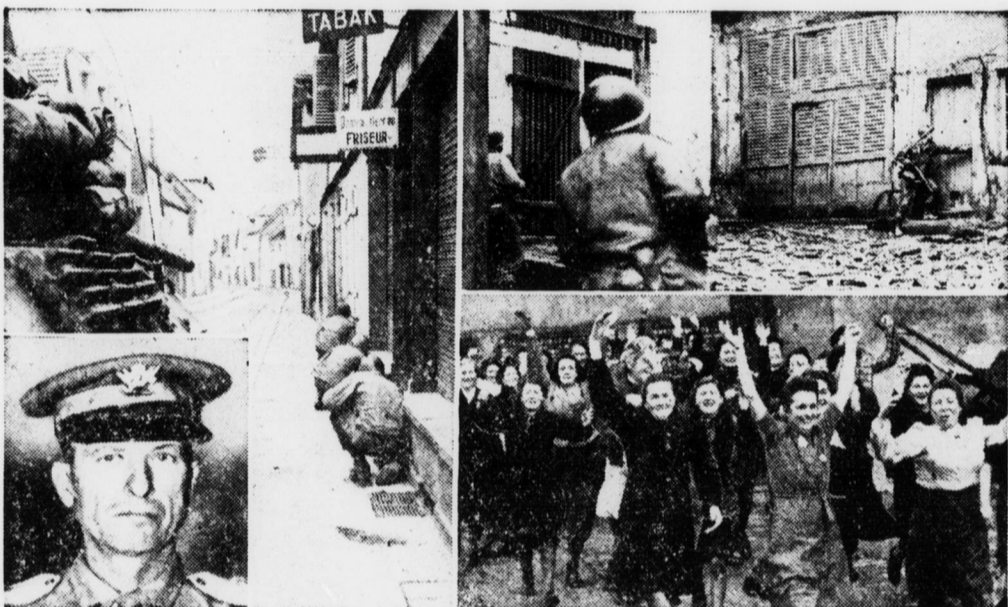
Lower left, Lieut. Gen. Alexander M. Patch, commanding officer of the famous Seventh army. Upper left, Seventh army infantrymen crouch low between tank and building as they hear enemy shells getting closer. Upper right, sniper hunting in Niederbronn, France. When the American Seventh army took Haguenau, they freed 300 Frenchwomen, who were being held in the town jail.