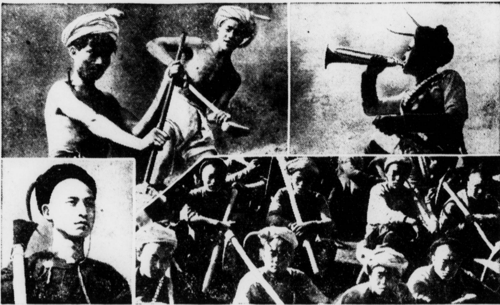
Centuries of independence has produced the pride and courage shown on the face of this Yi tribesman, lower left, who is among those rushing completion of the Sikang-Assam road in West China to Burma. Upper left, shows the tribesmen cutting through the solid granite. Upper right, they hold reveille. Lower right, some of the workers take time off to listen to the daily Chinese lessons given them.