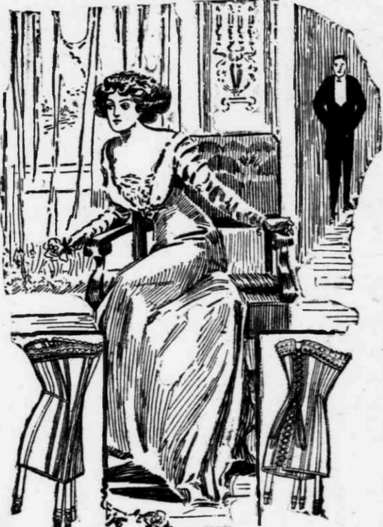
Copyright 1909 Kabo Corset Co. Kabo Style 690 is an extremely long, close fitting corset with medium high bust; is well reinforced at waist line where the greatest strain comes to a corset; made of batiste; 12 1/2 inch front clasp; supporters front and sides; white only. Sizes 18 to 30. Price, $1.00.

THE impression you make is governed a great deal by the corset you wear. No maker of fine gowns would ever attempt to give you a stylish appearance unless you wore the right corsets.