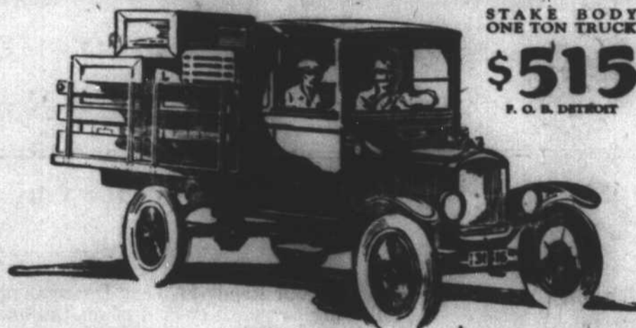
STAKE BODY ONE TON TRUCK