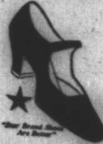
In Patent Leather you will like the way this shoe fits .....$7.95