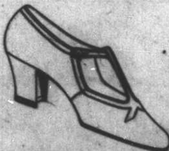
Light Tan Kid .....$7.50 Black Kid .....$7.50 Patent Leather, .....$7.50 Black Satin, .....$7.50