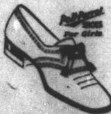
Black and Tan $4.50