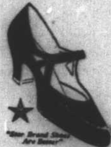
Satin and Patent, .....$6.50