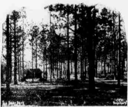
THE DEER PARK, PINEHURST.